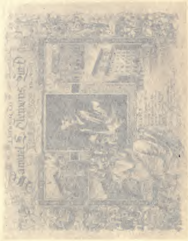
Menu of the dinner to Samuel L. Clemens, 1908